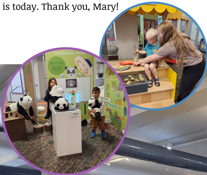
Exhibit Spotlight: Asian Culture